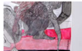
Heather Defferary £POA