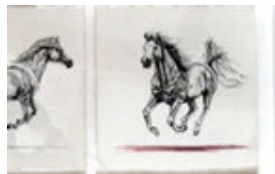
Bex Mair £190